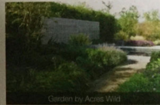
Garden by Acres Wild